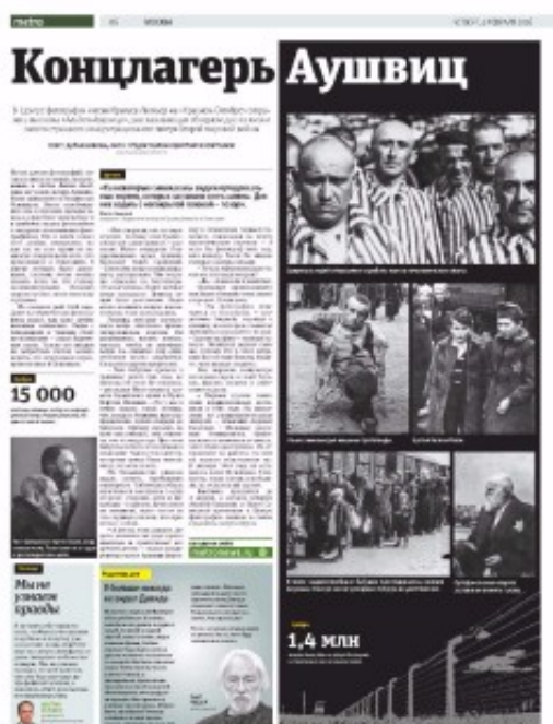
Article on the exhibition in the Moscow edition of the Metro newspaper