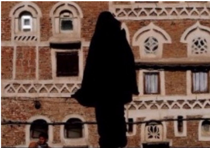
Photograph from the exhibition The Ancient Jewish Community of Yemen