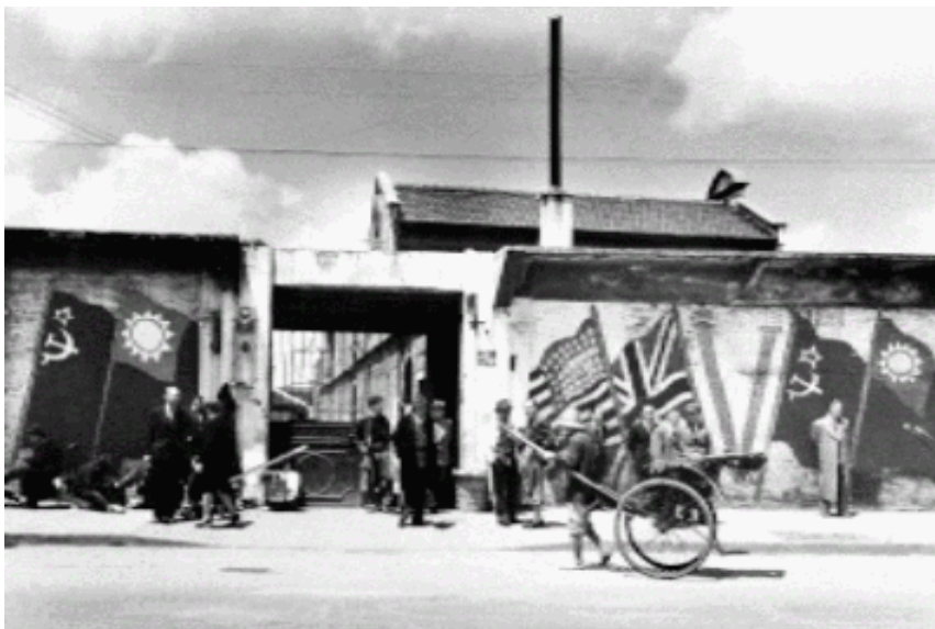
Entrance to the Hongkew refugee camp

between 300 and 400 people in this group, about three quarters of whom were Jews.