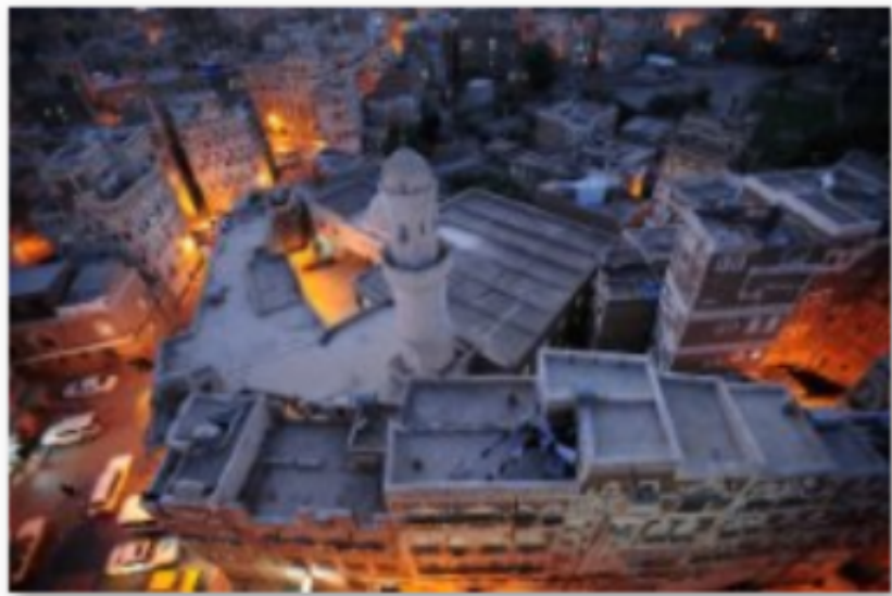
Photograph from the exhibition The Ancient Jewish Community of Yemen