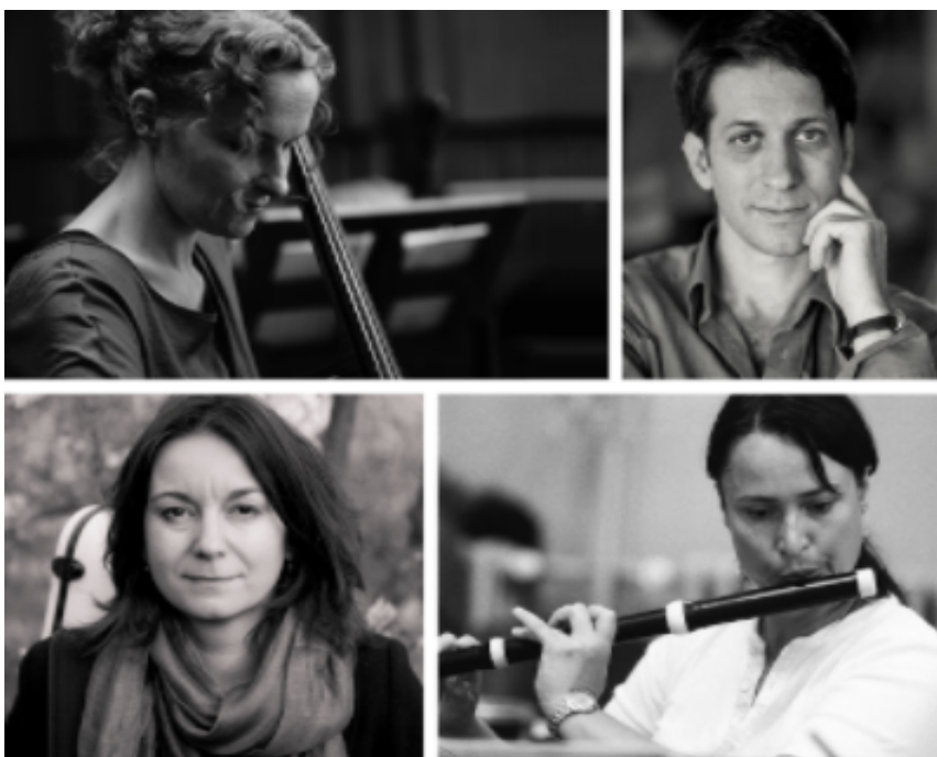
For Several Friends Ensemble