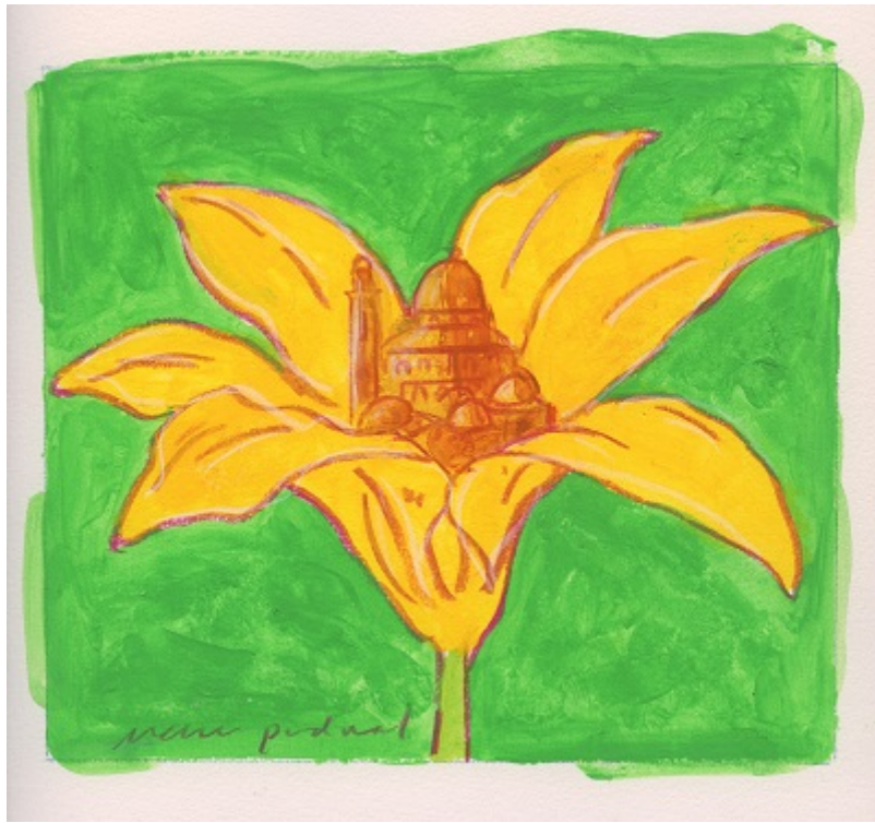
Mark Podwal – Song of Songs (2:2), 2016. © Mark Podwal