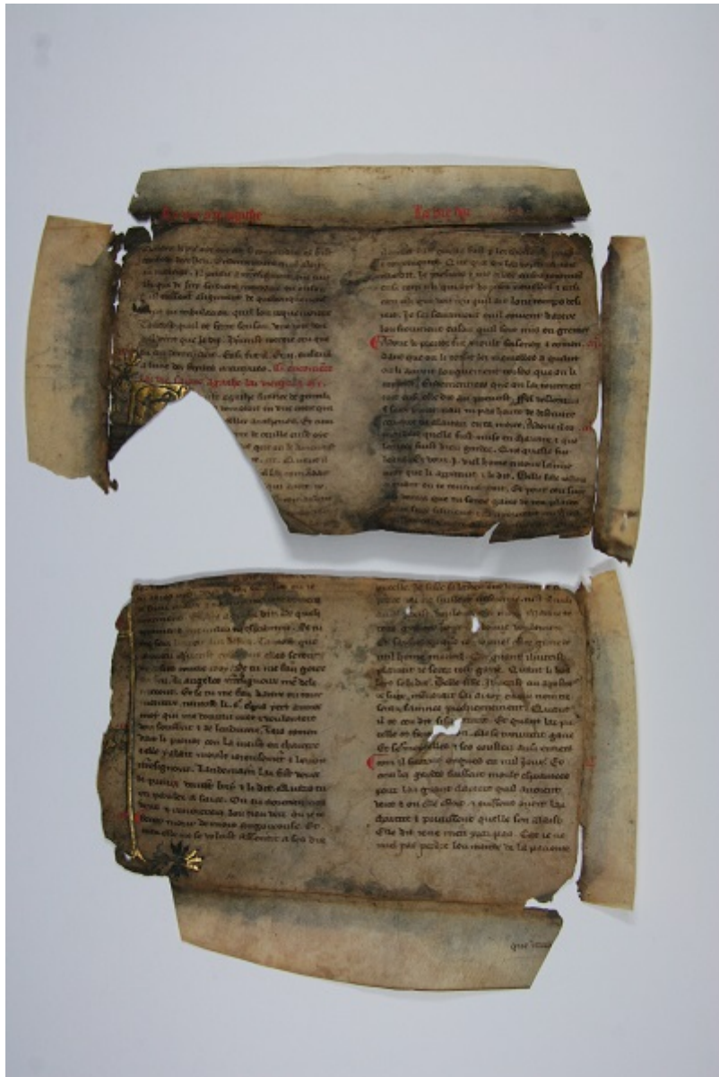
Manuscript fragment discovered during conservation of an old printed book

During conservation of Solomon ibn Gabirol's Mivhar ha-Peninim (Venice, 1546, acc. no. 2016/0086), a manuscript fragment on parchment was found in the book's covers. After consulting the Institut de Recherche et d'Histoire des Textes in Paris, we discovered that it is a new fragment of a liturgical legendarium in Old-French, described by Paul Meyer (see Paul Meyer, "Notice sur un légendier français du XIIIe siècle classé selon l'ordre de l'année liturgique", in: Notices et extraits des manuscrits de la Bibliothèque Nationale , 36/1, Paris, 1899). According to the script, it may be dated from the first half of the 14th century. It contains the end of The Life of Saint Blaise and a large part of The Life of Saint Agatha . The text is written in black-red ink with unusually well-preserved gilding of the initial capital and of the edge of the folio. The subsequent conservation of the manuscript fragment was carried out by the Jewish Museum's paper conservation department. It is being kept together with Mivhar ha-Peninim in the collection of rare printed books in our library.