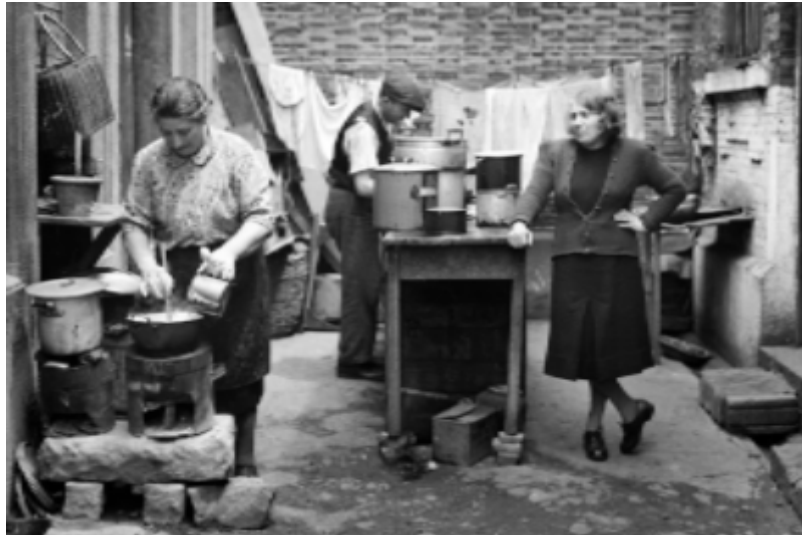
Arthur Rothstein: Communal kitchen and laundry in the courtyard of a residential block, April 1946

Robert Guttman Gallery, U Staré školy 3, Prague 1