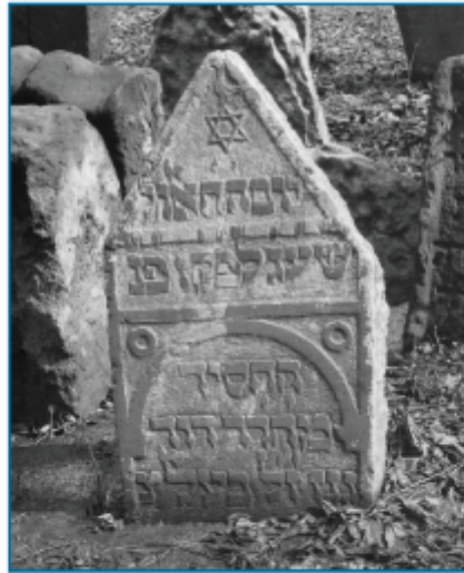
David Gans (1541–1613): A Reconsideration