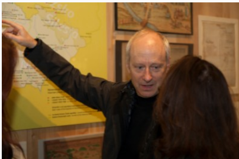
Michael J. Sandel

Michael J. Sandel, Professor of Political Philosophy at Harvard University, visited the Museum on April 19, 2016.