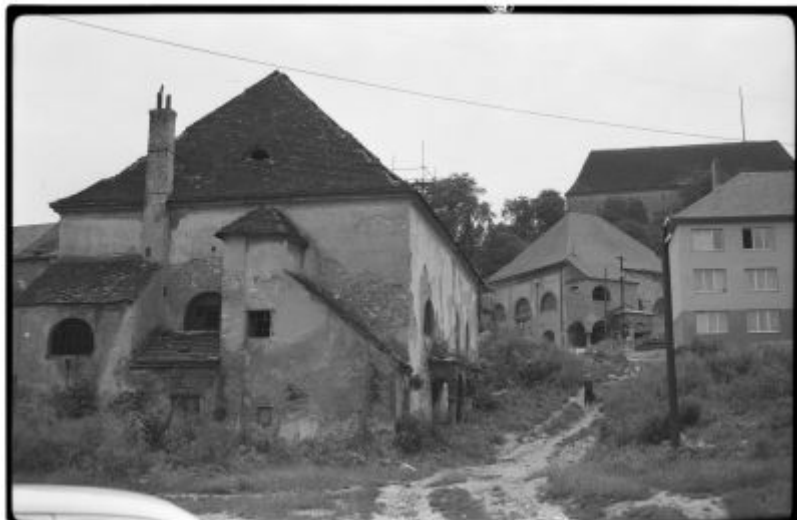
Lower and Upper synagogues in Mikulov in 1966

In addition to the large number of photographs of Czech and Slovak Jewish landmarks – cemeteries, synagogues, schools – the collection also contains photographs of non-Jewish landmarks – churches, chapels, shrines, and other important monuments. Fiedler’s photographs provide a valuable testimony to the state of monuments in the countryside and society’s historical development.