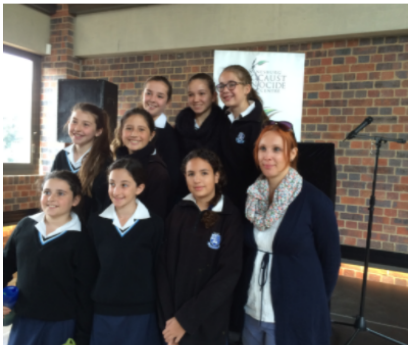
Jewish Daily School (Grade 6) Johannesburg.