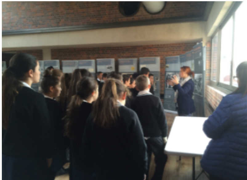
Jewish Daily School (Grade 6) Johannesburg.