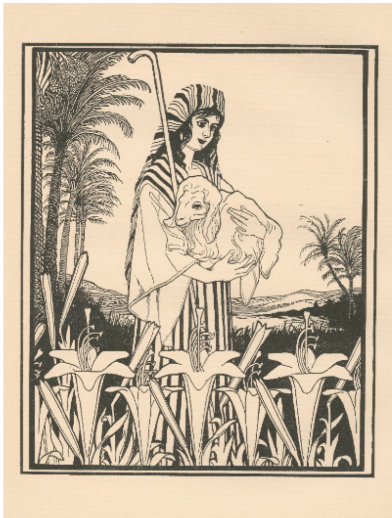
Die Bücher der Bibel – Die Liederichtung, Berlin & Wien 1923. Graphic layout and illustrations by Ephraim Moses Lilien.