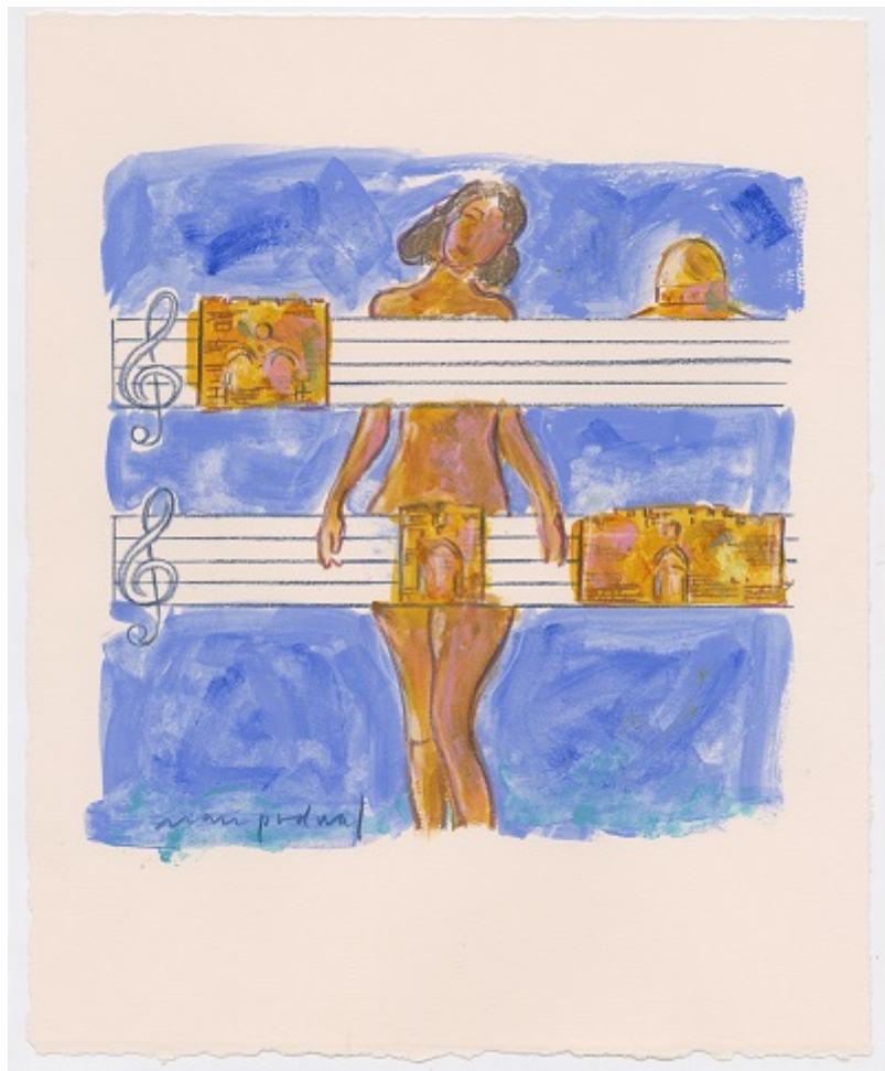
Mark Podwal – Song of Songs (5:7) , 2016. © Mark Podwal